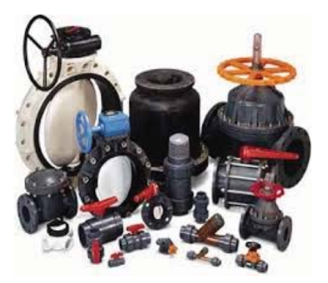
HIGH QUALITY PVC VALVES BALL VALVES, BUTTERFLY VALVES AND V-PORT BALL VALVES SIZES: 1"-12" ECONOMIC VALVE OIOICE