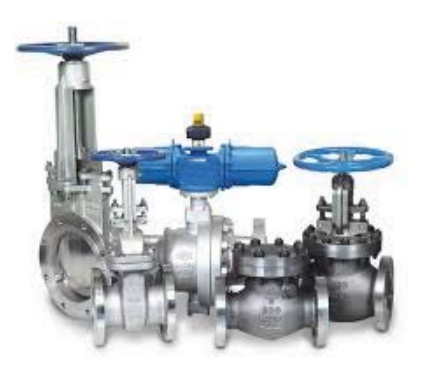
GATE, GLOBE, CHECK VALVES FLANGED, THREADED OR SOCKET AVAILABLE IN VARIOUS SIZES AND IN VARIOUS MATERIALS ANSI 150-1500#RF FLANGED