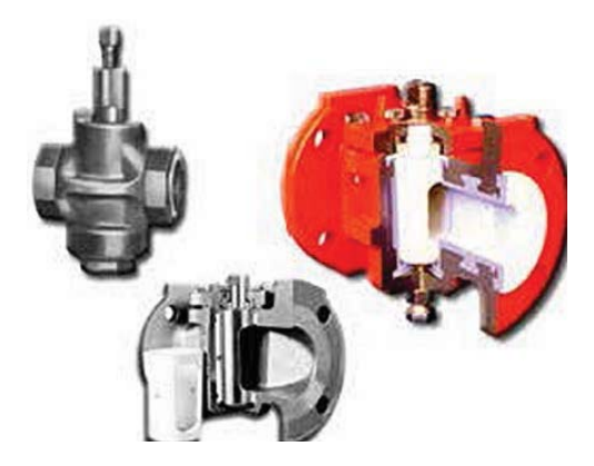
PLUG VALVES SLEEVED OR LINE SIZES: 2"-24" AVAILABLE IN VARIOUS MATERIALS AND LINERS

AVAILABLE IN ANSI FLANGES API 607 FIRE SAFE VALVE SIZES: 1/2" - 4" HEAVY-DUTY SOLDERED FUSIBLE LINKS