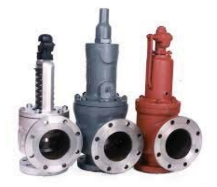
SAFETY RELIEF VALVES SECTION VIII SIZES: 1"-12" ANSI 150-900#RF MATERIAL: CARBON/STAINLESS STEEL