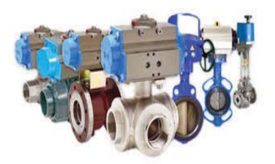
ACTUATED VALVES PNEUMATIC -ELECTRIC DIRECT MOUNT FOR LOW-PROFILE OR BRACKET MOUNT