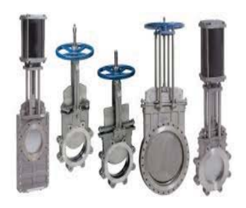
KNIFE GATE VALVES SLURRY, SLUETH OR CONTROL METAL OR SOFT SEAT FULL FACE FLANGE SIZES: 2"-24" MATERIAL: CARBON/STAINLESS STEEL