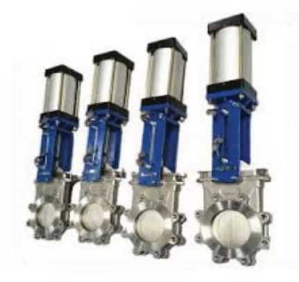
PNEUMATIC OR ELECTRIC KNIFEGATES

SMART ELECTRONICS WITH MANUAL OVERRIDES SIZES: 1/2"- 12" ANSI 150/1500# MATERIAL: CARBON/STAINLESS